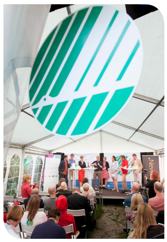
One of Nordic Ecolabelling Sweden's seminars during "Almedalen Week".

In November, Ecolabelling Sweden was involved in organising a National Workshop on sustainable consumption and production, with the focus on sustainable lifestyles. This is one of the UN's ten-year framework programmes (10YFP) and particularly topical in connection with the UN's new Sustainable Development Goals. The programme in question focuses on the 12th sustainability goal, which addresses responsible consumption and production. The Swedish Environmental Protection Agency is the main body responsible for this work in Sweden. Ahead of the conference, Nordic Ecolabelling met with a number of people working in the environmental area, and asked what 'sustainability' means to them and what we can do. The outcome was a short film that was shown at the conference and later published on YouTube.