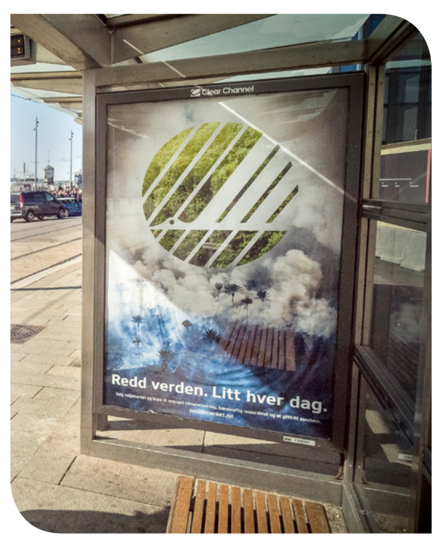
Outdoor campaign in Norway.