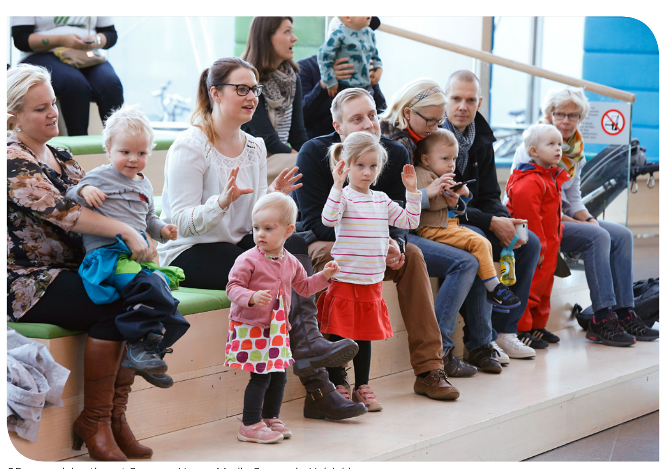
25year celebration at Sanoma House Media Square in Helsinki.

Environmentally friendly choices have now become easier for travellers with all Scandic hotels in Finland qualifying for the Nordic Ecolabel in 2015.