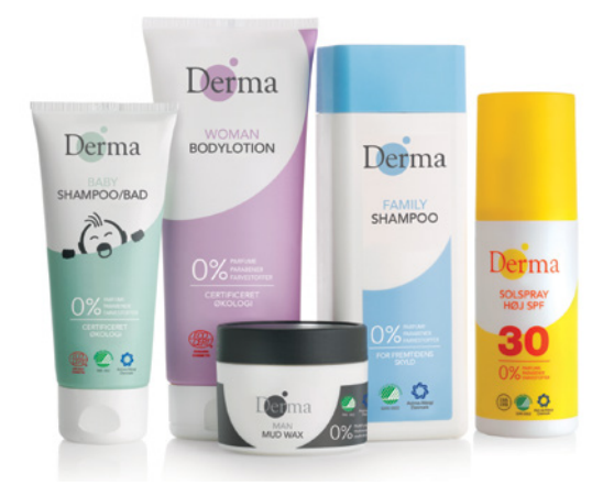
DermaPharm Nordic Swan Ecolabelled products

We plan on continuing with the Nordic Ecolabel since we are an environmentally conscious company. The label emphasizes that our products are environmentally friendly, and The Nordic Ecolabel keeps us up-to-date and helps develop our company in this area. It also helps us tell this story to end consumers better than we can.