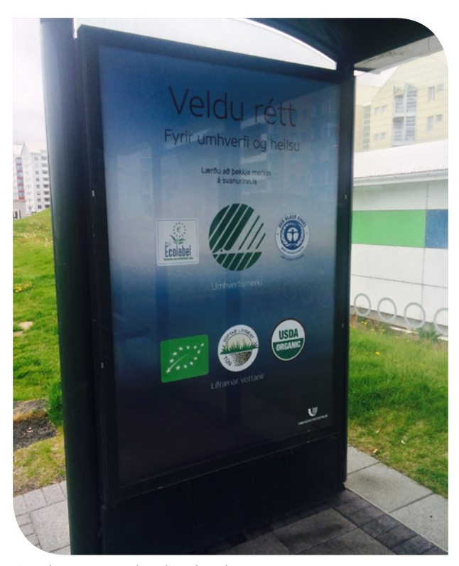
Outdoor campaign in Island