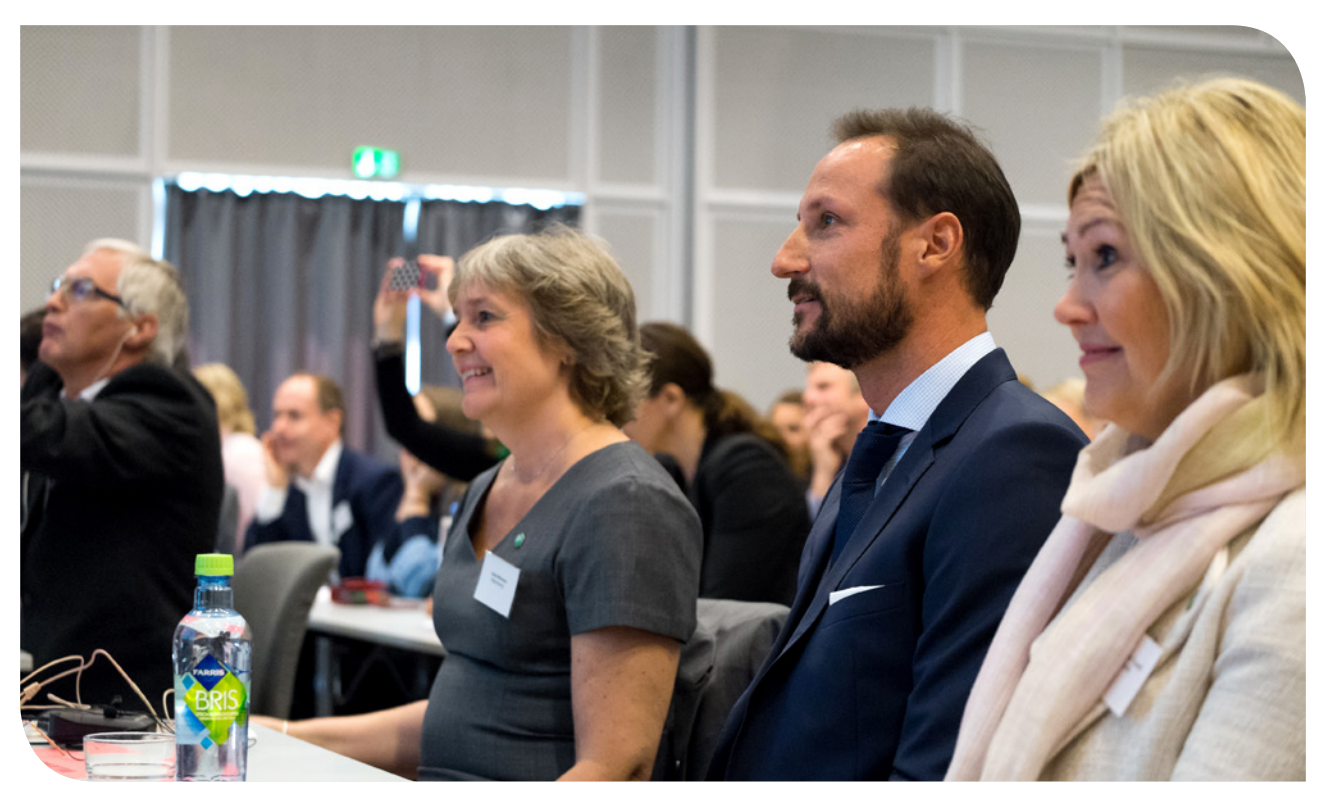
H.R.H. Crown prince Haakon of Norway attended the Nordic Ecolabel's 24th anniversary conference.

a brainstorming meeting with the aim of exploring the possibility of the license holders and importers working more closely with the Nordic Ecolabel in Iceland when it comes to marketing opportunities.