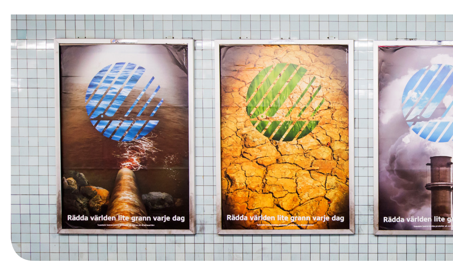
The campaign "Save the world a little bit every day" in Stockholm subway stations.

Procurement is a hot topic, and Ecolabelling Sweden has sought to influence future legislation by means of Op-Eds, comments on proposals circulated for consideration and meetings. Two well-attended seminars on procurement were held in Malmö and Stockholm in autumn 2015, with Ardalan Shekarabi, the Swedish